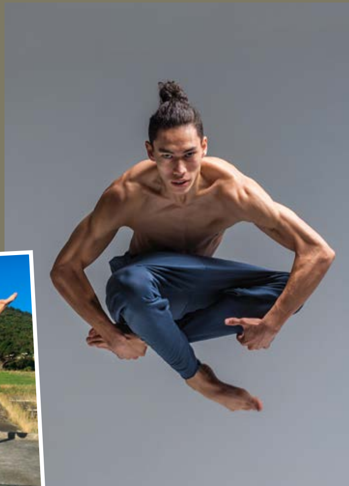
for the New Zealand School of Dance.