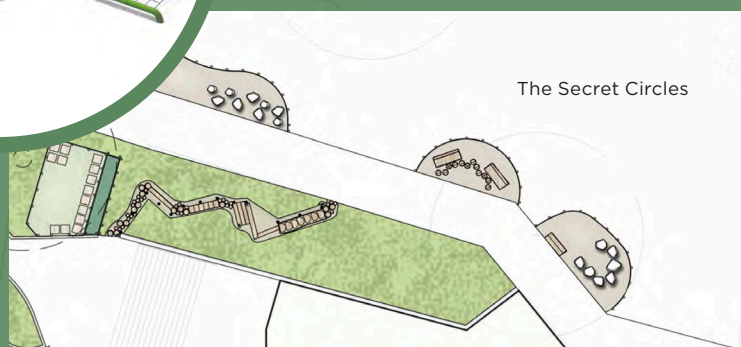
The Secret Circles