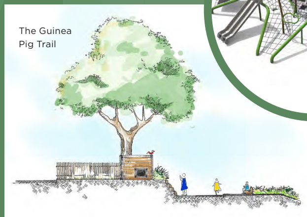
The Guinea Pig Trail