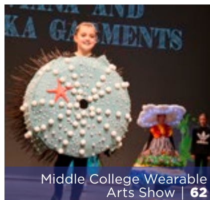
Middle College Wearable Arts Show | 62