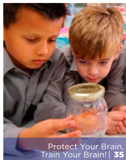
Protect Your Brain, Train Your Brain! | 35