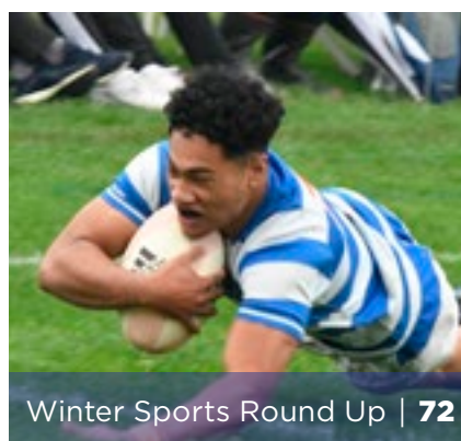
Winter Sports Round Up | 72