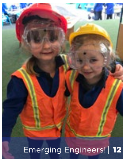
Emerging Engineers! | 12