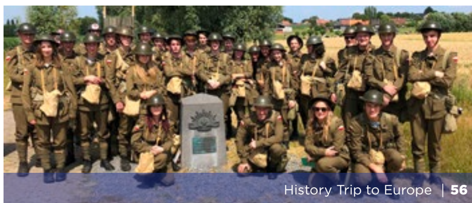
History Trip to Europe | 56