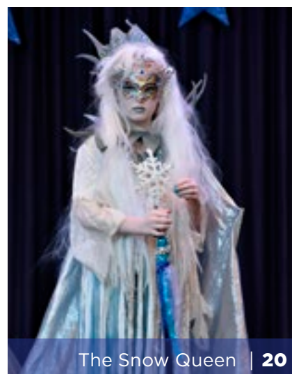
The Snow Queen | 20