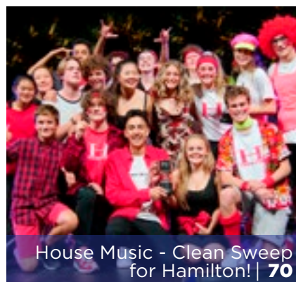
House Music - Clean Sweep for Hamilton! | 70