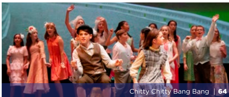
Chitty Chitty Bang Bang | 64