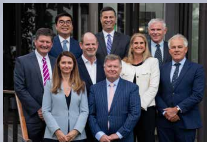
Saint Kentigern Trust Board

We are truly fortunate, but I am mindful that the virus has exposed the very sad truth that there are many in New Zealand who are not nearly