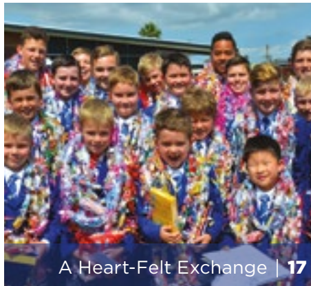
A Heart-Felt Exchange | 17