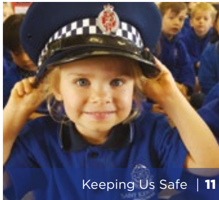
Keeping Us Safe | 11