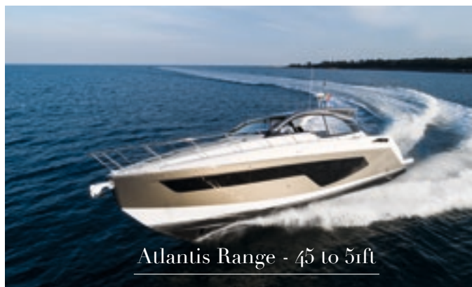
Atlantis Range - 45 to 51ft

Azimut Yachts: The Most Extensive Range in the World & Global Order Book no.1 ranked top builder for the 20th Year Running