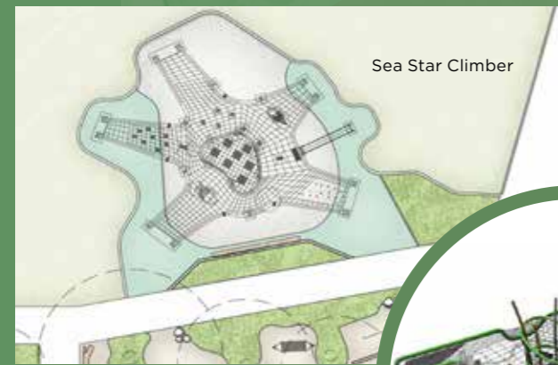
Sea Star Climber