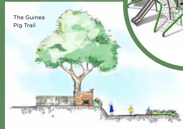
The Guinea Pig Trail