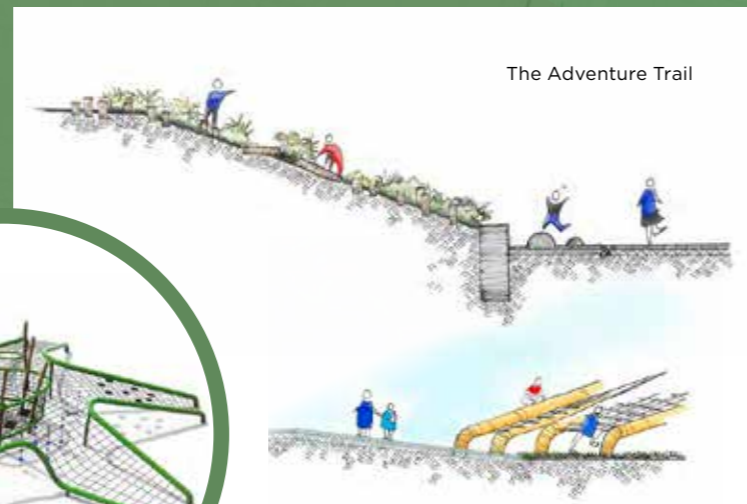
The Adventure Trail